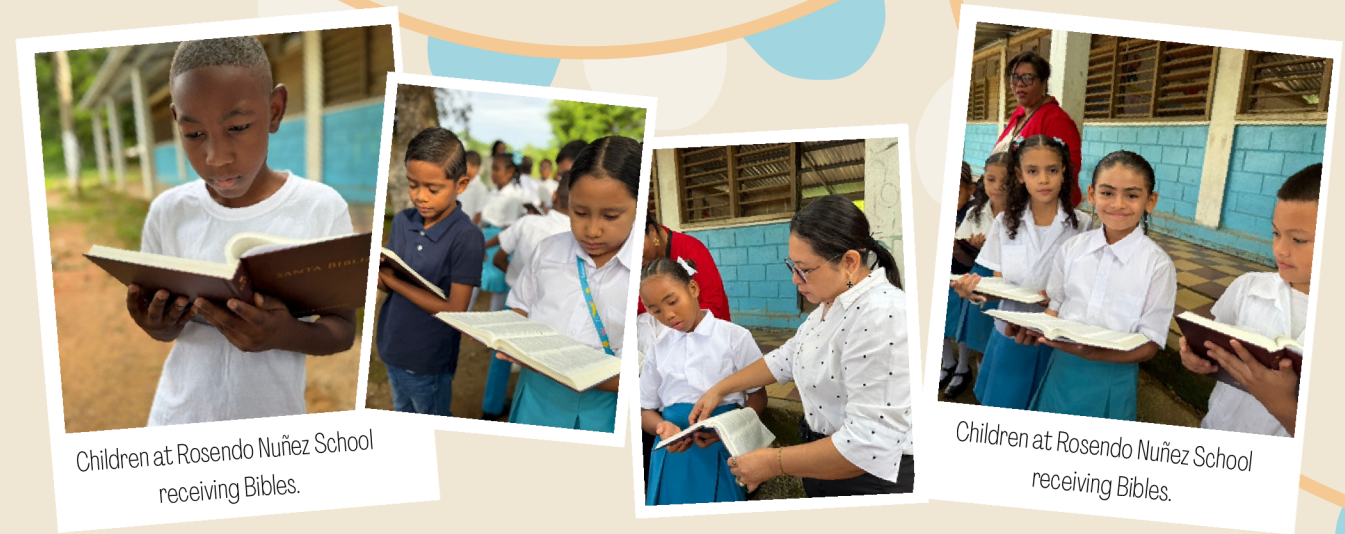
Children at Rosendo Nuñez School receiving Bibles.