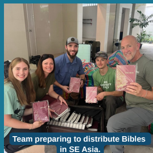
Team preparing to distribute Bibles in SE Asia.