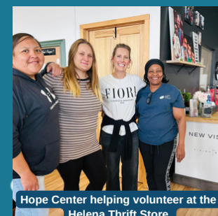
Hope Center helping volunteer at the Helena Thrift Store.