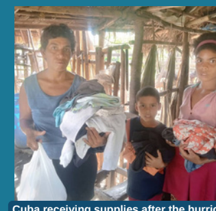
Cuba receiving supplies after the hurricane.