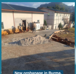
New orphanage in Burma.

As we look back on 2025, our hearts are overflowing with gratitude—for all that God has done and for each of you who have stood with us. This year has been marked by open doors, divine appointments, and countless lives impacted through the power of God's Word and the love of His people.