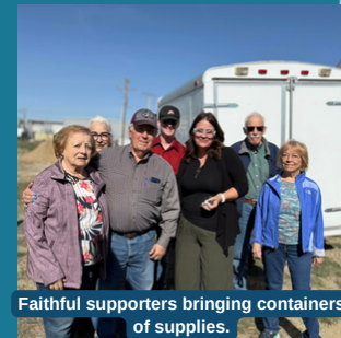
Faithful supporters bringing containers of supplies.

Looking ahead, we're excited to announce that two new thrift stores are planned for early 2026. These stores remain powerful ministry platforms, offering more than clothing and household goods—they bring the hope of Jesus to every community they serve. Thank you for being part of the story!