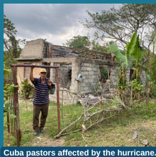
Cuba pastors affected by the hurricane.