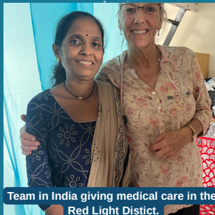
Team in India giving medical care in the Red Light District.

This year, Vision for Pastors continued to be a lifeline for faithful ministers serving in some of the most challenging mission fields. By God's grace and your support, we now financially support 143 pastors—118 in Cuba, 6 in Venezuela, and 19 in Nepal—with 14 new pastors added to the program this year. These men and women are pressing on to fulfill the Great Commission, often under dire circumstances. In October, a hurricane devastated parts of eastern Cuba, destroying homes, churches, and crops. Yet, even amid collapsed walls and flooded streets, our pastors rose up—not only to rebuild but also to reach out. With Bibles, supplies, and sacrificial love, they brought help and hope to their communities. As one report shared, “Once again, the Gospel was preached by our pastors, not only with words, but with the tangible demonstration of God's immense love for Cuba.” Your generosity is not just sustaining lives—it's empowering the Church to shine brighter in the darkest places.