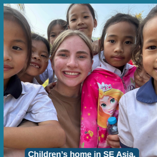
Children's home in SE Asia.