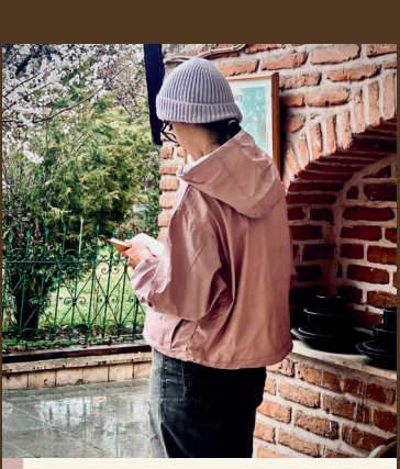
A young woman reading the Bible that was given to her during street ministry.

In tea shops, on rain-soaked sidewalks, and even in the courtyards of mosques, the Gospel went out. Smiles widened as old friends recognized us from previous trips. Workers eagerly received New Testaments. A tour guide at a mosque clutched a Farsi Bible with joy. In a bold moment, even an Imam—a Muslim leader—took a New Testament in hand.