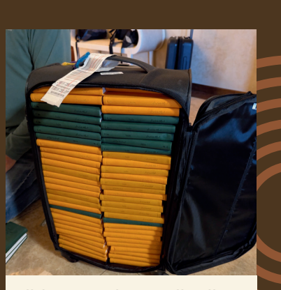
Bibles ready to distribute to a contact in Armenia.