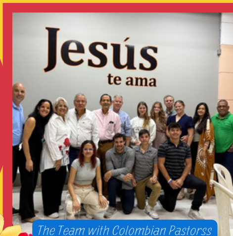
The Team with Colombian Pastors

The Spanish Bible Project continues to deliver God's Word to the people who need it most in South America, including countries like Colombia.