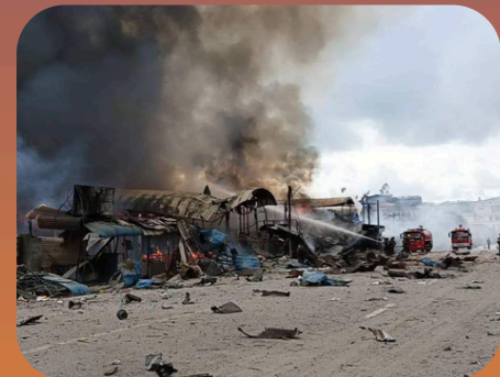
Lashio city after bombing.

Burma (Myanmar) faces an ongoing humanitarian crisis, with ethnic minorities and Christians suffering persecution and displacement. A civil war lasting over 70 years has claimed more than 300,000 lives, as the military regime—supported by China and Russia—uses chemical warfare, bombings, and violent crackdowns. Despite these challenges, resistance remains strong, with 90% of the population opposing the dictatorship.