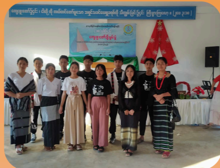
Saramati Hall Children's Home

Caregivers offer more than just safety—they offer the hope of the Gospel. Their faith inspires others as they teach children to wake early, read their Bibles, and pray daily—even for the soldiers who killed their parents. Their example is a testament to the power of faith and forgiveness.