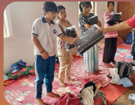
Receiving blankets, mats etc.

Even in difficult circumstances, the desire for God’s Word is clear. Those who receive Bibles often express their gratitude warmly. “They were so thankful,” shared another traveler. For many, these Bibles provide much-needed hope and comfort.