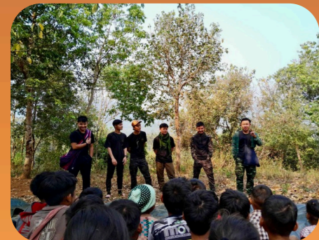
Young Christian soldiers

Entire villages are burned, families are shattered, and survivors are left to rebuild amidst unimaginable loss. Christians are particularly targeted for their faith, living in constant fear. A traveler shared the grim aftermath of an attack: “Piles of ash with nothing left but human skulls. It was hard to watch, but it weighed on my heart—this is their daily reality.”