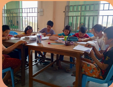
Winner Educare Children's Home

Amid the turmoil, God’s Word is making a difference. Hundreds of Bibles and audio scriptures have reached people who never had access to them. One traveler remarked, “It’s hard to imagine what it’s like to read the Bible for the first time, but it’s powerful. I pray they discover new life in Jesus.”