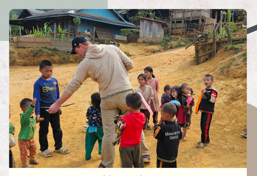
Jackson entertaining the children to help make enroads to share the Gospel in a remote village.