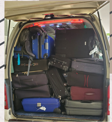
Bibles packed up and ready to be moved by the team in a closed country.

May this testimony serve as a reminder of God's sovereignty, the priceless nature of His Word, and the power of prayer in our lives. Let us embrace these truths, cherishing His Word and cultivating a vibrant prayer life as we walk in faith.